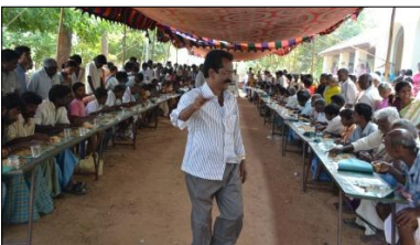
Good Shepherd Mission— Feeding 600-700 locals