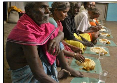
Good Shepherd Mission— Beggars received food and clothes

http://www.youtube.com/watch?v=88MX3lmyjKU